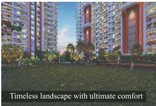
Timeless landscape with ultimate comfort