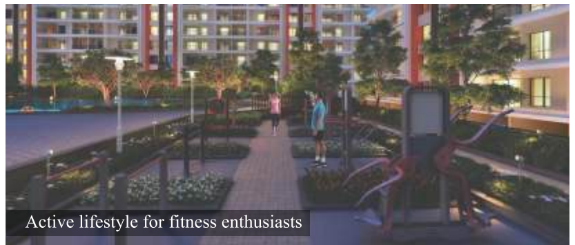
Active lifestyle for fitness enthusiasts