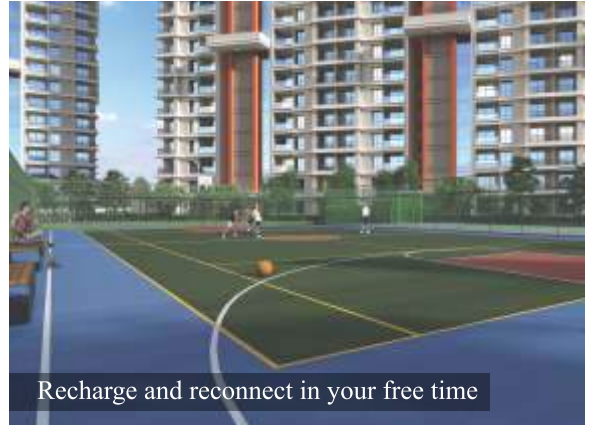
Recharge and reconnect in your free time