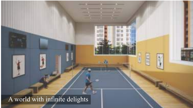
A world with infinite delights