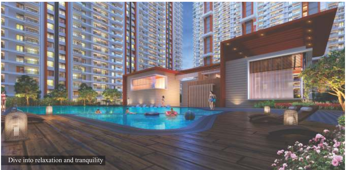
Dive into relaxation and tranquility

Play Zones: Toddlers' Play Area | Sand Pit | Kids' Play Area | Ludo | Skating Rink